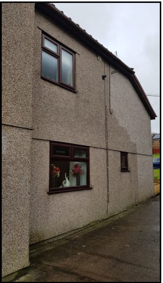
Side Elevation 159 Bryn Road, Brynmenyn

overlooking into the private rear amenity space of 159 Bryn Road, there are no windows proposed to be installed into the side, south westerly facing elevation of the property. The side elevation of the neighbouring property has three window openings, as shown below: