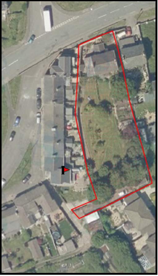
168 Bryn Road, Brynmenyn

Therefore, it is considered that the erection of the proposed dwelling would not result in unreasonable overlooking or overbearing, over and above the current situation, to warrant a refusal on such grounds. It is considered that the principal and usable private amenity area of 168 Bryn Road immediately surrounds the dwelling and the garden area which lies to the south is a secondary part of the garden area which is likely to be used less frequently. It is therefore considered that the introduction of a dwelling in the proposed location does not detrimentally impact the existing levels of privacy or amenity currently afforded to the occupier(s) of 168 Bryn Road and it is therefore acceptable from a residential amenity perspective.